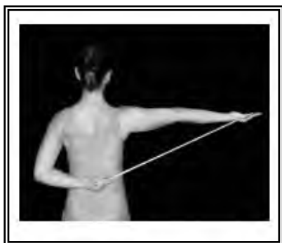
BACK TWIST UNDER/BOTTOM GRIP ONLY

The twisted hand is in the centre of the back, with the fingers extended along the rod or gripping the rod. The untwisted arm is straight to the side at shoulder level, holding the rod between the thumb and the first finger , keeping the fingers and wrist straight.