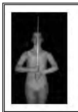
FLASHING OF THE ROD SINGLE/MULTIPLE UNDER/BOTTOM GRIP e.g. to the Left side

The twisted hand is in the centre of the back, with the fingers extended along the rod or gripping the rod. The untwisted arm is straight to the side at shoulder level, holding the rod between the thumb and the first finger , keeping the fingers and wrist straight.